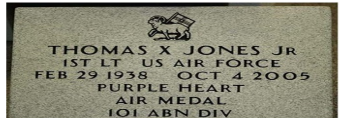
SMALL FLAT GRANITE (L)

This grave marker is 18 inches long, 12 inches wide, and 3 inches thick. Weight is approximately 70 pounds. Variations may occur in stone color.